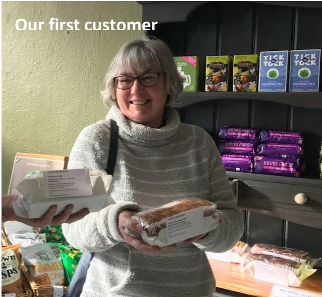
Our first customer