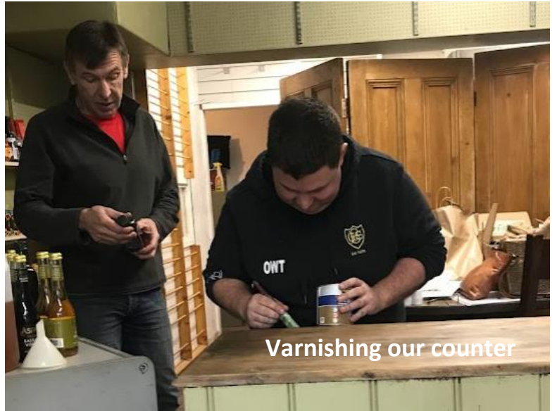
Varnishing our counter