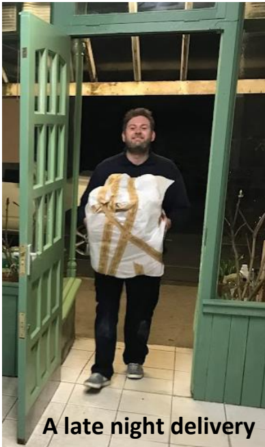
A late night delivery